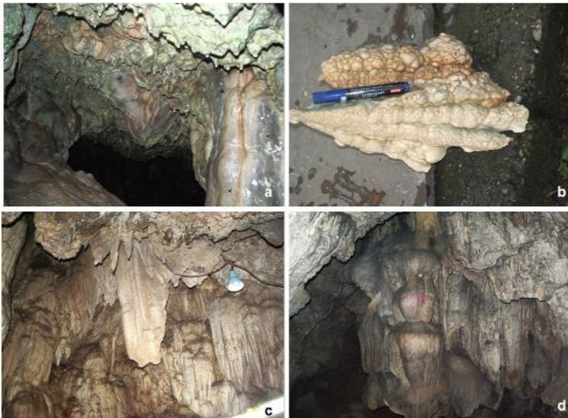
Fig. 2 : a. Dripping water in the Sahastradhara cave showing stalactites and stalagmites during monsoon studied for oxygen isotope (location 2) b. Stalactite column from Sahastradhara cave studied for carbonate microfacies and C and O isotope ratios (location 2 in Fig. 1) c. Speleothems in Brahamakhal (Prkateshwar) cave studied for microfacies and C and O isotope ratios (location 1 in Fig. 1) d. Speleothems from Mawsmay cave showing pillar like structures near Cherrapunji, Meghalaya, (Location 3 in Fig. 1)

as Sahastradhara ), a place of the thousand drippings which is a very simple phenomenon has invested with peculiar sanctity in the eyes of the people from the side of a charming valley to the east of Rajpur, oozes a mountain stream, distilling its waters over a precipice thirty feet high, and leaving a crust of lime on everything it touches. Particles, thus accumulating for continuous, have made a projecting ledge forming a sort of cave, from the roof of which falls a perpetual rain that turns every glade of grass coming in contact with it into a petrification. From above hang stalactites innumerable (Fig.2 a,b). Stalagmite covers the ground beneath. Opposite, there is a sulphur spring also possessing powers of petrification." The seven caves of the Sahastradhara are small in size approximately, 10m long, 2m wide. The smallest one is 2.5m long and 2m wide.