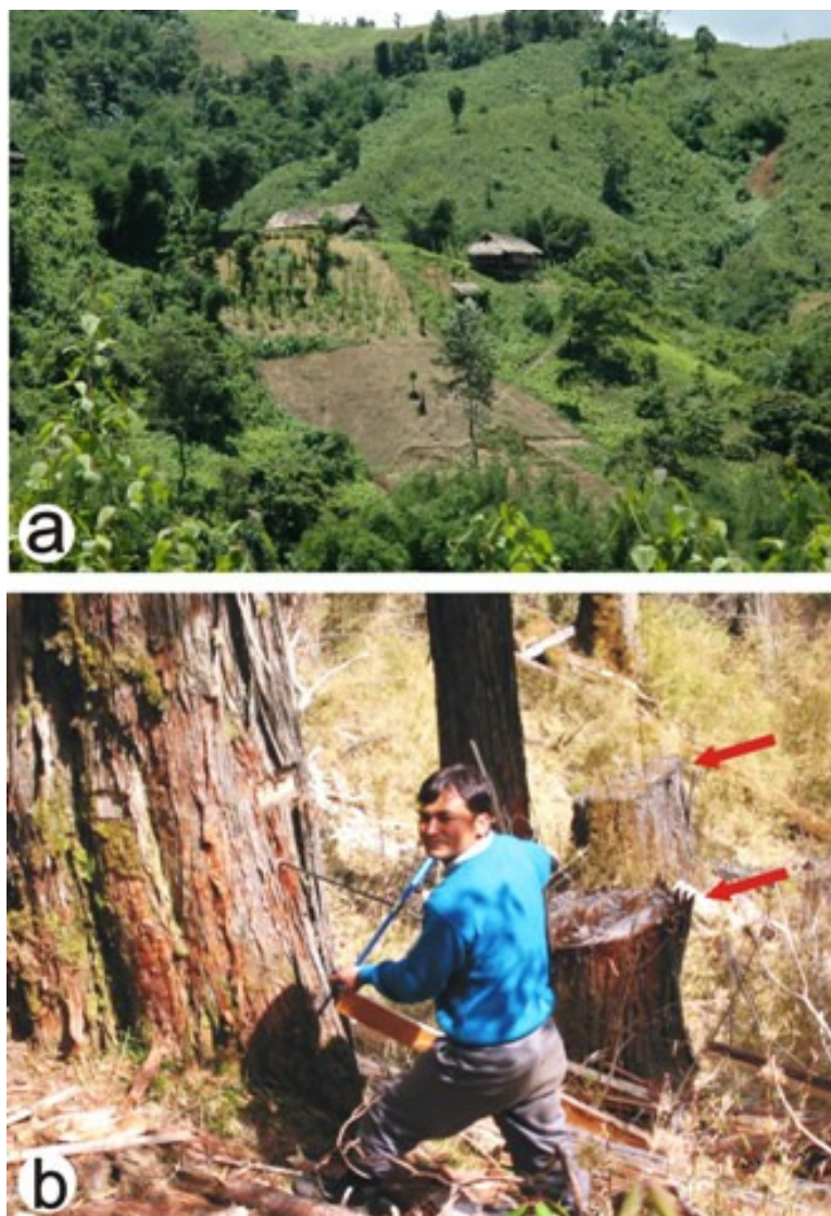
Fig. 2 : a. Photograph showing shifting cultivation in Arunachal Pradesh. b. Photograph showing the two Juniperus tree stumps and author is doing coring in Juniperus tree for determination of tree age by counting annual rings.