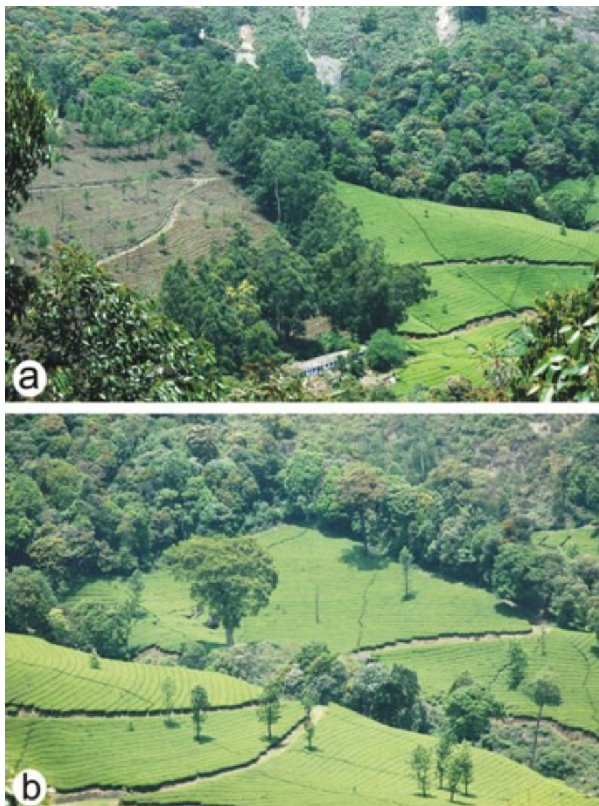
Fig. 3: Photographs showing Camellia sinensis (L.) Kuntze plantation and barren forest land in Munnar.